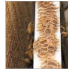
Wild Blossom Meadery's mead