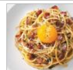
100 Best Eats of 2009