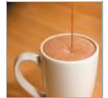
XOCO's hot chocolate