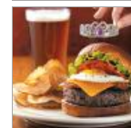
2009 Eat Out Awards