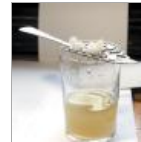
Delilah's Sweet 16 absinthe