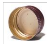
2009 BYOB Guide